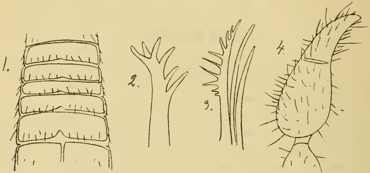
Fig. 1. Atemnus floridanus n. sp. — 1 The five first segments, 2 galea, 3 flagellum, 4 chela.

Pedipalpus of considerable thickness, shorter than the body. Coxa a little wrinkled, thinly clothed with simple hairs, the first of which are very long. The inner contour of trochanter more convex than the outer one. Femur short, pedicellated, nearly twice as long as broad; the inner contour to begin with convex then concave to straight, the outer convex and the more so in the nether part of it. Tibia a little longer than femur, evidently pedicellated, the both contours convex. Manus longer than tibia and more long than broad and longer than the curved digiti. All joints clothed with simple, very long hairs, on tibia and manus rare and on digiti numerous very long hairs. All joints smooth or very finely punctuated.